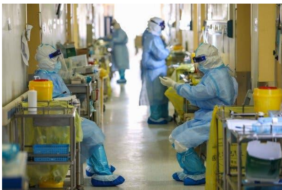
A Red Cross hospital in Wuhan, China, the outbreak’s epicenter.

Independent experts said these projections were critically important to act on, and act on quickly. If new infections can be spread out over time rather than peaking all at once, there will be less burden on hospitals and a lower ultimate death count. Slowing the spread will paradoxically make the outbreak last longer, but will cause it to be much milder, the modelers said.