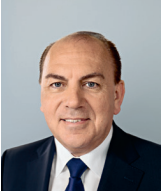
Axel A. Weber, Ph.D. Chairman of the Board of Directors UBS AG