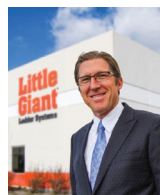
Art Wing Chairman Little Giant Ladders